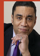
Actor Harry Lennix Master of Ceremonies Stars in the NBC hit series "The Blacklist"

3320 West Adams Blvd., Los Angeles, CA 90018