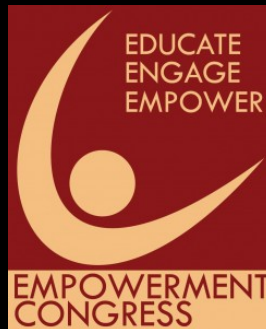
Mental Health Committee